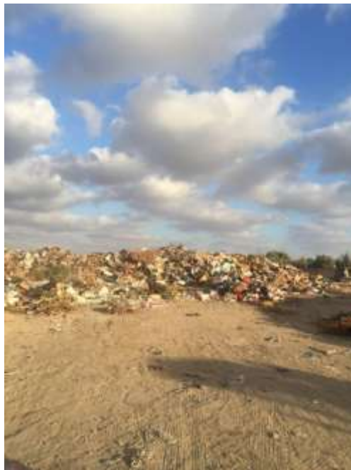
Figure 4: One of an open dumping sites in Misurata