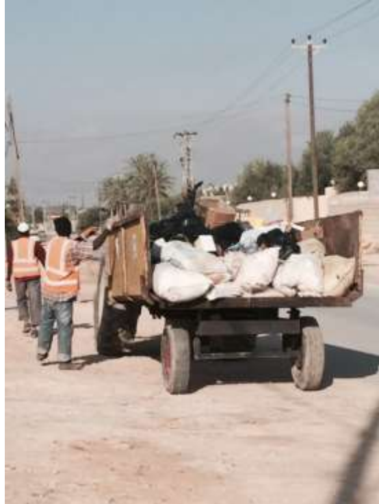
Figure 3: Waste transportation in Zone No. 8 in Misurata